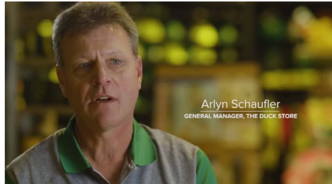
Watch the Customer Spotlight Video: The Duck Store

NetSuite uses the latest open source third-party technology, such as Backbone.js, Handlebars.js and Sass, to provide a flexible framework for SuiteCommerce. This not only ensures that your site is feature-rich and