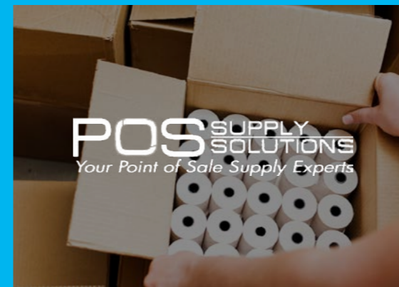
POS Supply Solutions