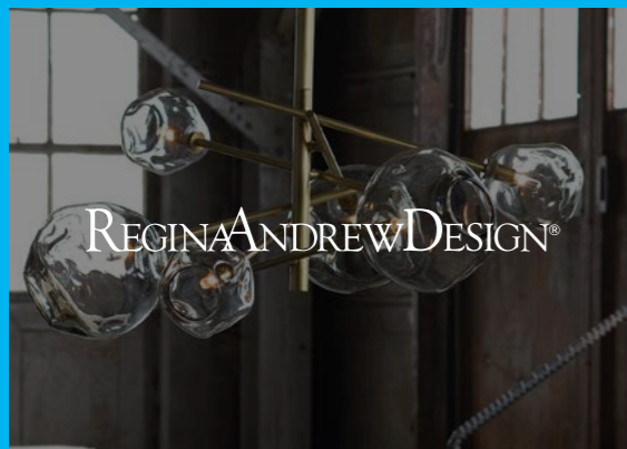
Regina Andrew Design

LEARN HOW SUITECOMMERCE HAS HELPED THESE COMPANIES TRANSFORM THEIR BUSINESSES WITH A COMPLETE SUITE.